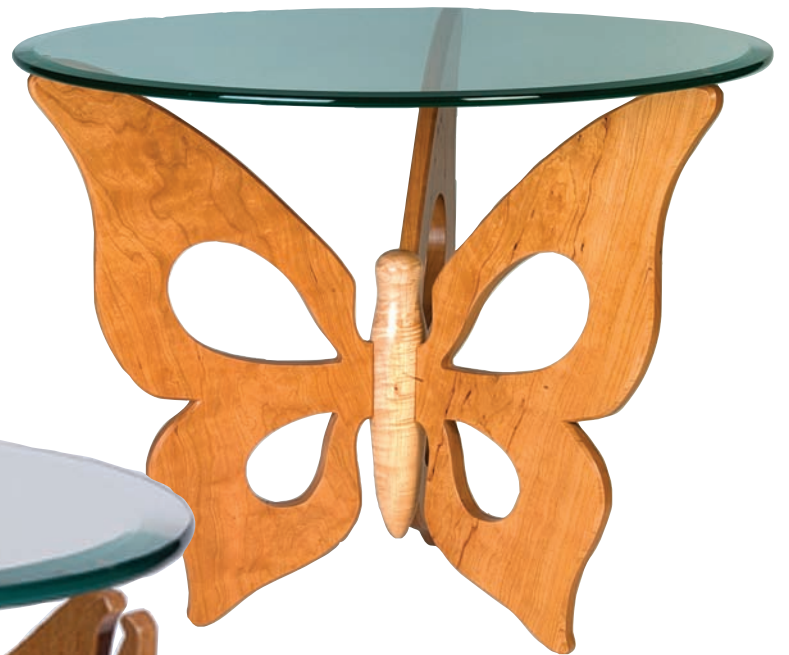
Top: Wings carved from cherrywood adorn the butterfly table. Bottom: The salmon table is made of lacewood, with rainbow obsidian for the fish eyes. Opposite: Dennis Esquivel in his element, with a slab of quilted African cherry.

them being dragged by their horses, or drowning after their canoe tipped over.”