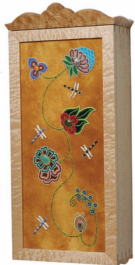
Top: The canoe table is fashioned from quilted African cherry, bird’s-eye maple, Eastern curly cherry, and stainless steel. Bottom: A cabinet of maple, cherry, and Spanish cedar features smoked deerhide decorated with Great Lakes floral motifs and dragonflies crafted by Teri Greeves from beads, seed pearls, natural pearls, turquoise, ocean jasper, jade, spiny oyster shell, lipidolite, and sterling silver. Opposite: Esquivel perfects the mortise-and-tenon joinery for his butterfly table.

Unlike some wood artists, Esquivel does all the sanding and cutting himself, not just the designing: “I do send pieces out for