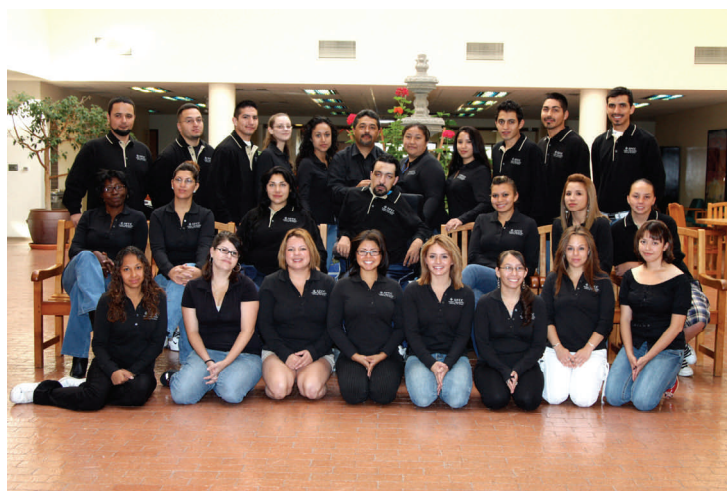
STUDENT AMBASSADORS FALL 2008

As important as giving to others is to all Ambassadors, our groups gives back to us. It's very nice that we get a scholarship for all our hard work, but we get much more from the group than that. The Student Ambassador Program teaches us leadership skills, public speaking, networking skills, team development, how to write a resume build a portfolio, etc. They teach you how to get what you want out of the world the best way possible in addition to working the information desk helping the Aspire Club with their functions like the Halloween, Whoop It Up 3 on 3 Basketball tournament, or assisting student government, MPR Outreach, OSD, and other specific departments on campus.