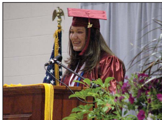
SFCC held its 2007 commencement ceremony on May 18, graduating its largest class in the college's 24-year history.