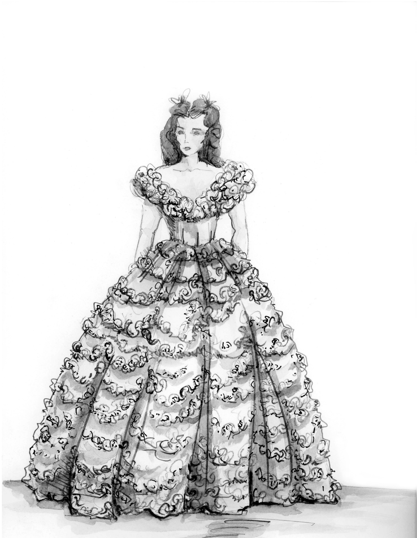
Sketch of the Youth Eco-Dress